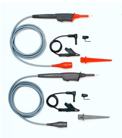
72941, Kit Scope Probes, X10 Insulated, 500 MHz, Red & Gray