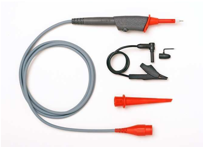
72940-2, X10 Insulated, 500 MHz, Red (additional photos on page 2)

Insulated Scope Probes for use with portable Oscilloscopes.