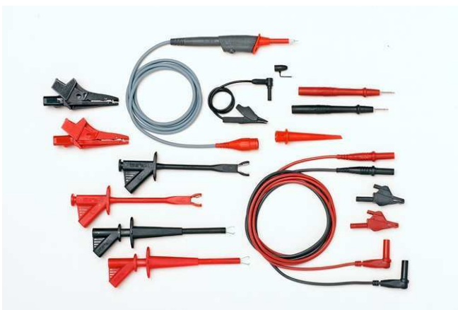
72942, Probe & Lead Kit for Portable Scopes

USA: Sales: 800-490-2361 Fax: 888-403-3360 Europe: 31-(0) 40 2675 150 International: 425-446-5500 e-mail: technicalsupport@pomonatest.com Where to Buy: www.pomonaelectronics.com